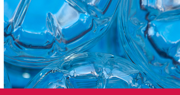
Fundsmith Sustainable Equity Fund SICAV Owner's Manual