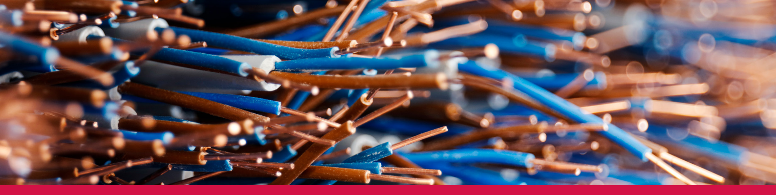
Fundsmith Sustainable Equity Fund SICAV Owner's Manual

We often find industry classifications to be a poor indicator of a company's actual business activities, as the descriptions oversimplify and group together diverse business models.