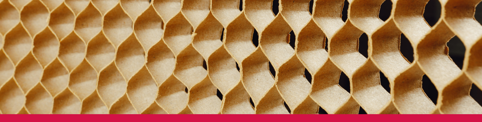
Fundsmith Sustainable Equity Fund SICAV Owner's Manual

Note that we are not just looking for a high rate of return. We are seeking a sustainably high rate of return. An important contributor to this is repeat business, usually from consumers. A company that sells many small items each day is better able to earn more consistent returns over the years than a company whose business is cyclical, like a steel manufacturer, or "lumpy", like a property developer.