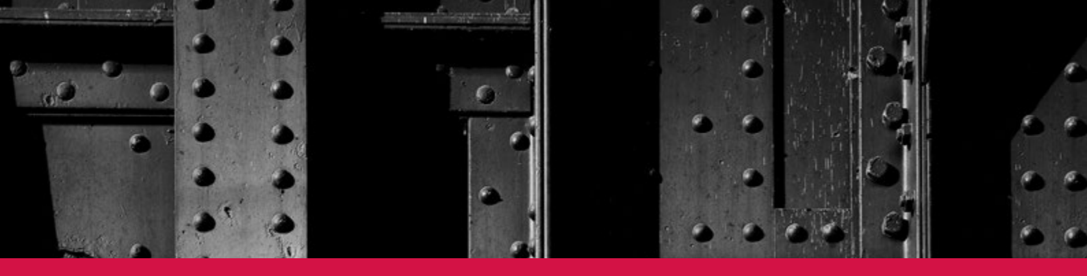
Fundsmith Equity Fund SICAV Owner's Manual